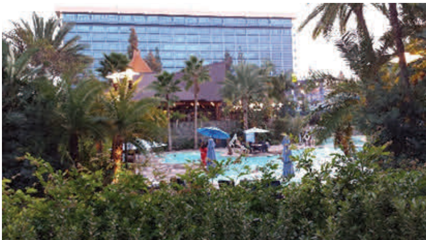
Registration Desk at the 2014 PACRAO Conference

Disneyland is celebrating its 60th birthday this year. The park will have several special features in celebration. Look for these while at the PACRAO 2015!